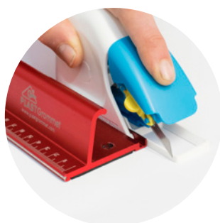
Guide for Foam board cutters