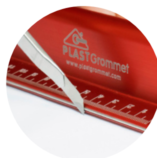
Stainless steel cutting edge