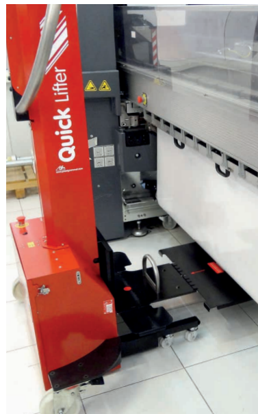
Easy load printers