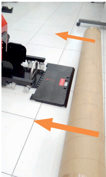
Load rolls from the ground