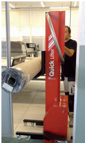
Passes through narrow doors (80cm)